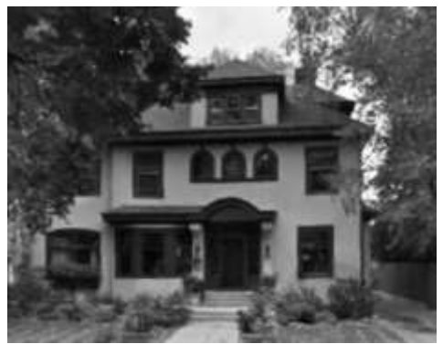
Figure 5: Bert lived at 1808 Knox Ave S. for many years, beginning in 1909.